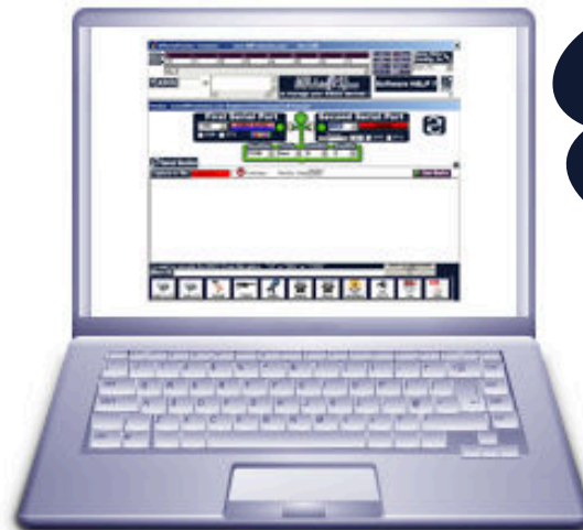
PC or Laptop with two Serial Ports running Bill Serial Port Monitor

If your computer does not have a serial port then use a USB to RS232 with FTDI chipset