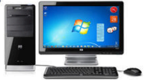
PC that communicates with the device